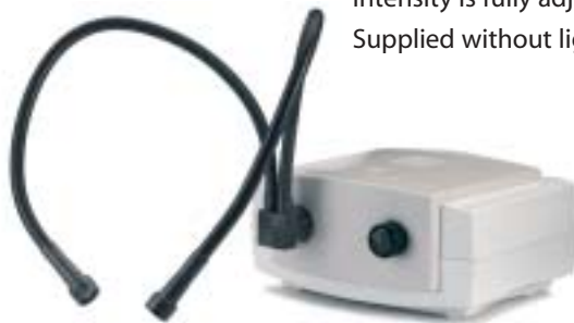
LE.5211 and LE.5214

The multi functional 150 Watt cold light source LE.5211 is a brand new Euromex design cold light illuminator with a 150 Watt halogen lamp. The light intensity is fully adjustable. Supplied without light guide.