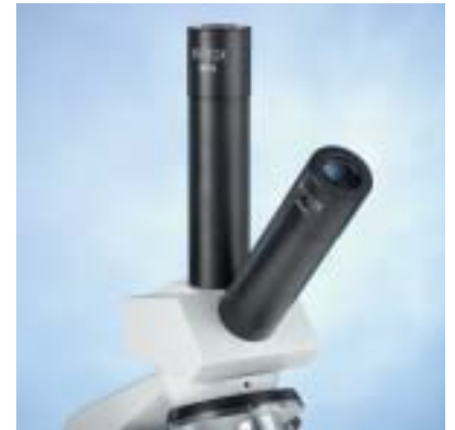
Discussion tube AE.5811