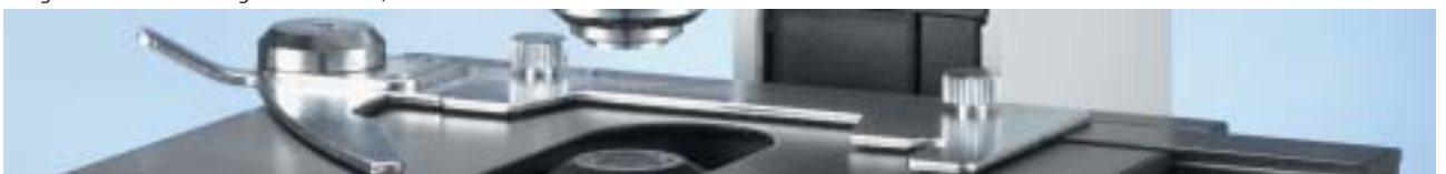
Integrated mechanical stage from XE.5645, XE.5647

The LED illumination – with built-in rechargeable battery and charger – is ideal in case there is no 230 Volts connection. The light power is adjustable. Fully charged batteries are suitable for 75 hours of usage.