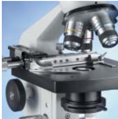
Mechanical stage AE.5173