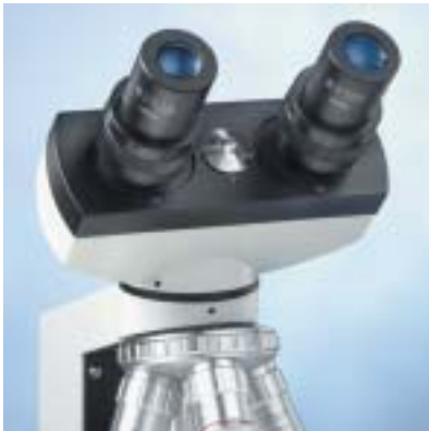
Binocular head AE.5808